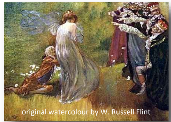
original watercolour by W. Russell Flint

— his legs are mortal!) and when she sees Strephon kissing a seemingly young woman, she assumes the worst. But her "rival" turns out to be none other than Strephon's own mother, Iolanthe, a fairy — fairies never grow old. But Phyllis' guardian, the Lord Chancellor, and half the peers in the House of Lords are sighing after her. Soon the peers and the fairies are virtually at war, and long friendships are nearly torn asunder. But all is happily sorted out, thanks to the "subtleties of the legal mind".